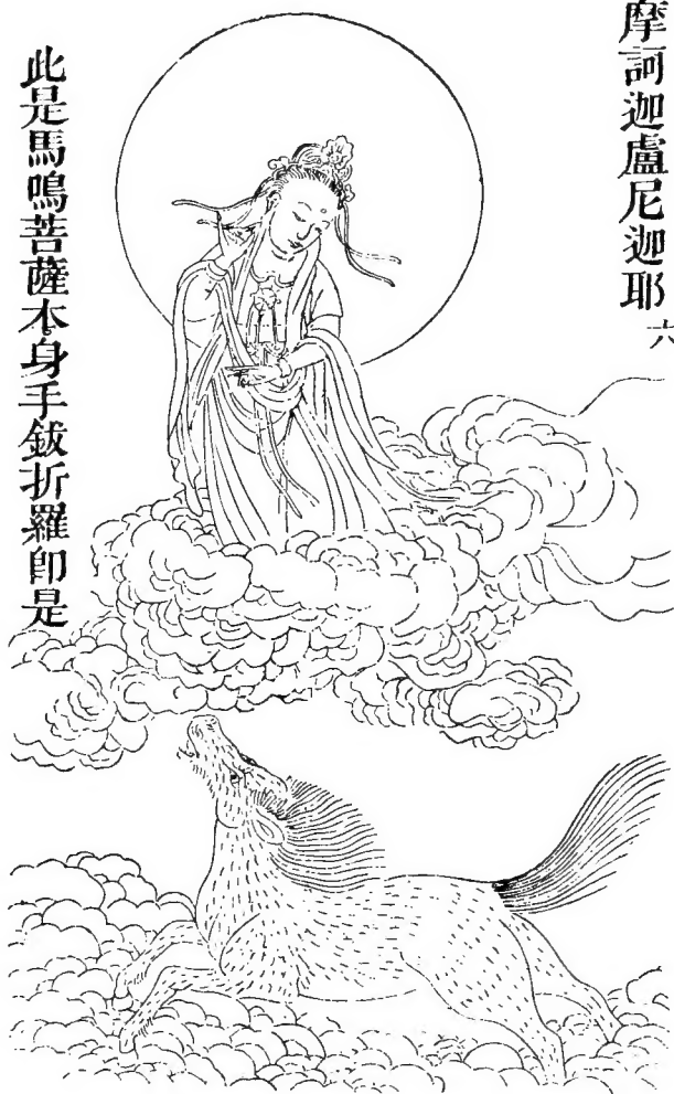
ASHVAGOSHA—THE NEIGHING HORSE.